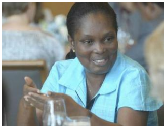
H.E. Dr. Bernice T. Dahn

Dr. Bernice T. Dahn is the Minister of Health for the Republic of Liberia. Starting at the end of Liberia's second civil war, she served for nine years as Deputy Minister for Health Services and Chief Medical Officer for the Ministry of Health in the Republic of Liberia. Dr. Dahn has spearheaded programs to rebuild Liberia's health system and re-establish the Ministry of Health post-war. She was also responsible for the restoration of routine health services in the wake of the Ebola epidemic of 2014-15.