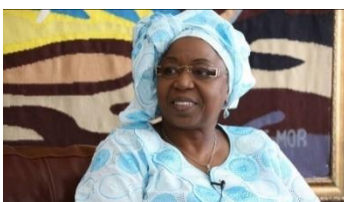
H.E. Dr. Awa Marie Coll Seck

Awa Marie Coll Seck has served as Minister of Health of the Republic of Senegal since 2012. She was Executive Director of the Roll Back Malaria Partnership (RMB) from 2004-2011 and served as Director of the UNAIDS Department of Country and Regional Support from 1996-2001. She was Minister of Health and Prevention of Senegal from 2001 to 2003.